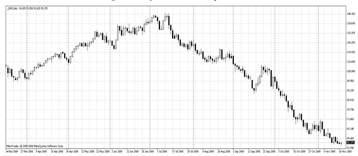
Fig. 2. The daily chart of prices for oil in 2008

As we can see, the charts are almost identical, though the exchange instruments we analyzed are very different – currency pair and the commodity asset – oil.