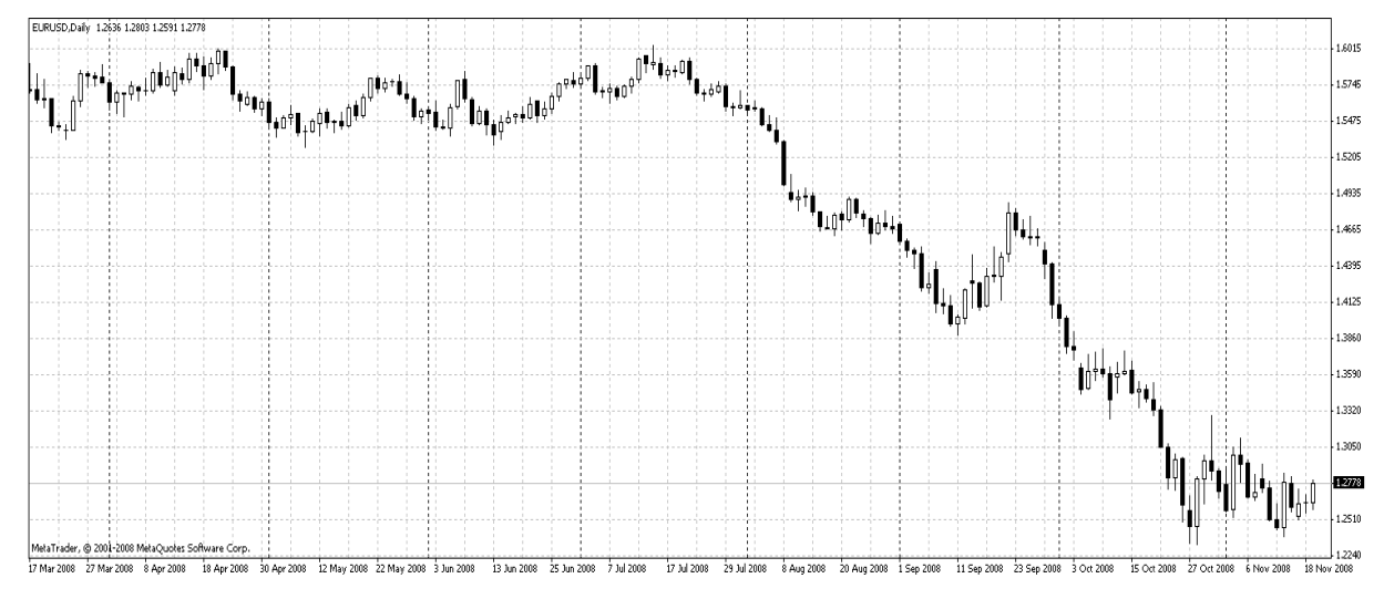
Fig. 1. The daily chart of EUR/USD quotes in 2008

year – on gold, 2 years later – on the stock market and so on. As a visual illustration of the proposed hypotheses, we will show the daily chart of oil and EUR/USD in 2008 (Figures 1 and 2) [3].