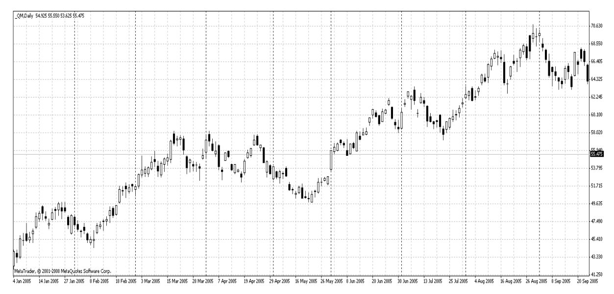
Fig. 4. The daily chart of prices for oil in 2005

As we see, the focuses of the market are not constant and shift from time to time. As an analysis tool we will use the pair correlation analysis, because it is better and more objective than a simple comparison of two charts of instruments, and allows to appraise in figures this "focus" of the market, figuratively speaking – the force of market's concentration on something.